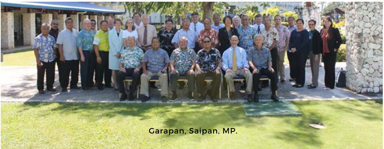
Garapan, Saipan, MP.