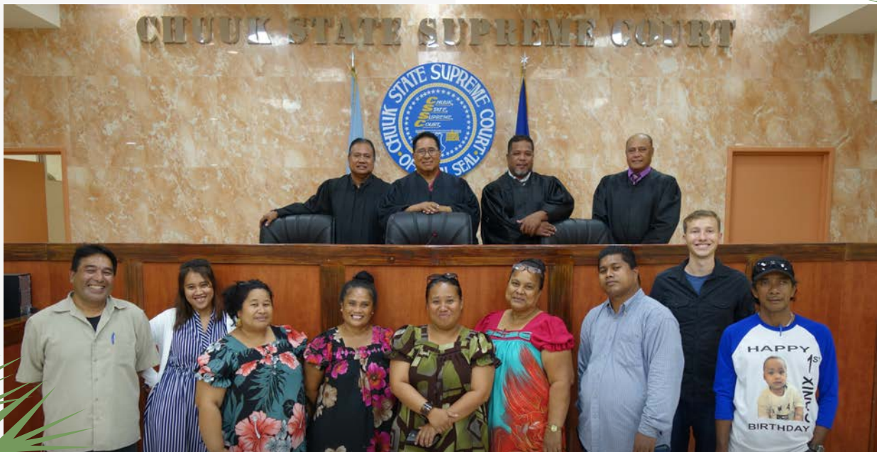
Pictured: Chuuk State Supreme Court Judicial Officers and Staff