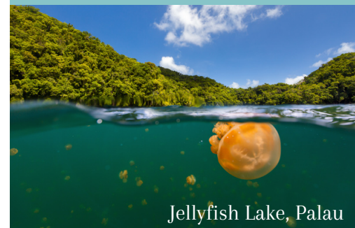
Jellyfish Lake, Palau