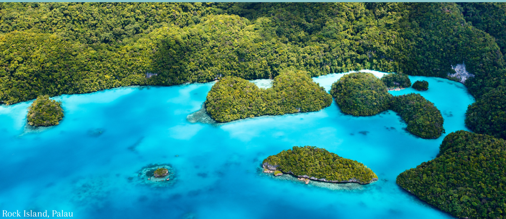
Rock Island, Palau