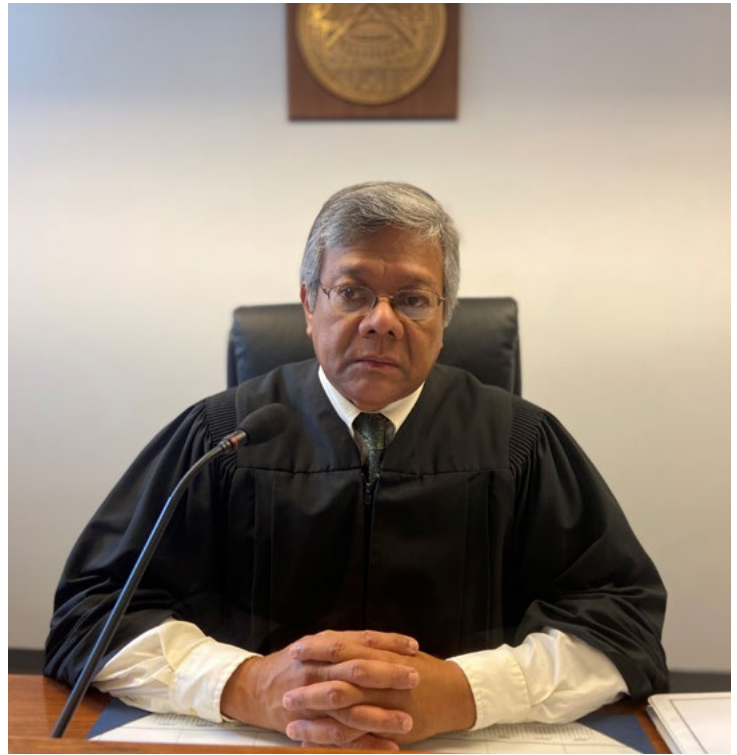
Acting Associate Justice Elvis R. Pila Patea

Judge Patea started his judicial career in 1999 as a pro tem judge, and five years later joined the High Court as staff attorney. In 2009, he was appointed by the Governor of American Samoa and confirmed by the Senate of the local legislature as one of two full-time judges on the District Court. Judge Patea has been the sole judge on the District Court for almost two years now. The types of cases he hears in District Court are approximately 80 percent criminal and traffic cases, 5 percent civil cases, 10 percent small claims (up to $7,500), and the rest are miscellaneous cases such as child support enforcement and uncontested adoption cases.