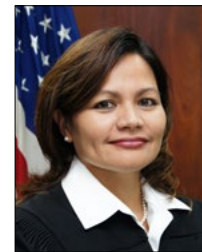
Hon. Ramona Villagomez Manglona, Chief District Judge, Northern Mariana Islands

Talofa! (That means hello in Samoan.) American Samoa is a United States territory comprised of seven islands and atolls located in the South Pacific Ocean, southeast of the independent nation of Samoa. Except for a few limited causes specified by federal statutes, all matters arising under federal law in American Samoa are adjudicated over 2,500 miles away in the U.S. District Court for the District of Hawaii or 7,000 miles away in the U.S. District Court for the District of Columbia in Washington, D.C.